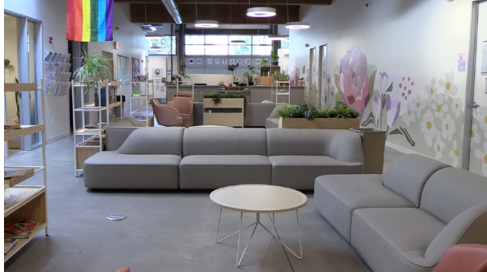
The common shared space at Rose Haven in Portland, where women can go for shelter, food, clothing and safety, while also receiving physical and mental health support and services.

Rose Haven is celebrating its 25th year of compassionate service as the only day shelter for women in Portland. Its holistic approach includes meeting basic needs for food, clothing and safety, while providing support for long-term empowerment through education, connection, practical help and emotional support.