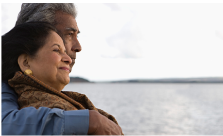
St. Jude Neighborhood Health Centers offers mental health and psychiatric care and provides essential support to the Orange County community.

In partnership with Providence Orange County hospitals, St. Jude Neighborhood Health Centers offers thousands of underserved Orange County residents compassionate mental health and psychiatric care they would have difficulty finding elsewhere.