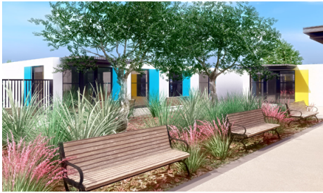
The Victorville Wellness Center.

Access to healthy foods is a nationwide issue and is especially challenging for residents in San Bernadino's High Desert. Characterized by high poverty rates and limited fresh food availability, this region is referred to as a "food desert."