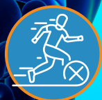
CAN'T KEEP UP WITH PEOPLE YOUR AGE

* It is important to note that symptoms alone aren't enough to diagnose EIB. An objective test performed by a specialist is required.