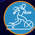
CAN'T KEEP UP WITH PEOPLE YOUR AGE

* It is important to note that symptoms alone aren't enough to diagnose EIB. An objective test performed by a specialist is required.