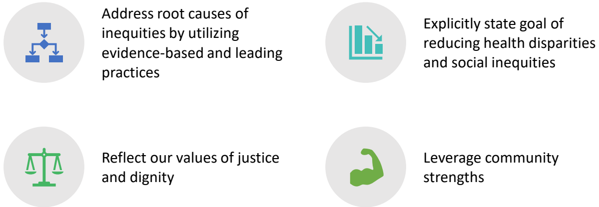
Figure 1. Best Practices for Centering Equity in the CHIP

To ensure that equity is foundational to our CHIP, we have developed an equity framework that outlines the best practices that each of our hospital will implement when completing a CHIP. These practices include, but are not limited to the following: