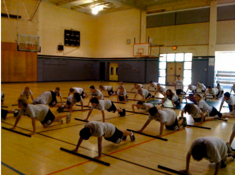
Healthy For Life: A Childhood Obesity Prevention & Intervention Program

St. Joseph Health, St. Joseph Hospital Orange FY 12 – FY 14 Community Benefit Plan/ Implementation Strategy