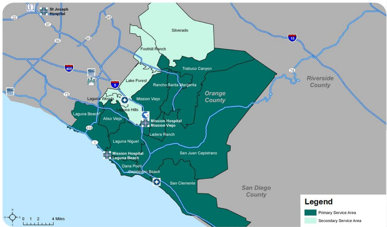
Figure 1. Mission Hospital Total Service Area

Figure 1 (below) depicts the Hospital’s PSA and SSA. It also shows the location of the Hospital as well as the other hospitals in the area that are a part of St. Joseph Health.