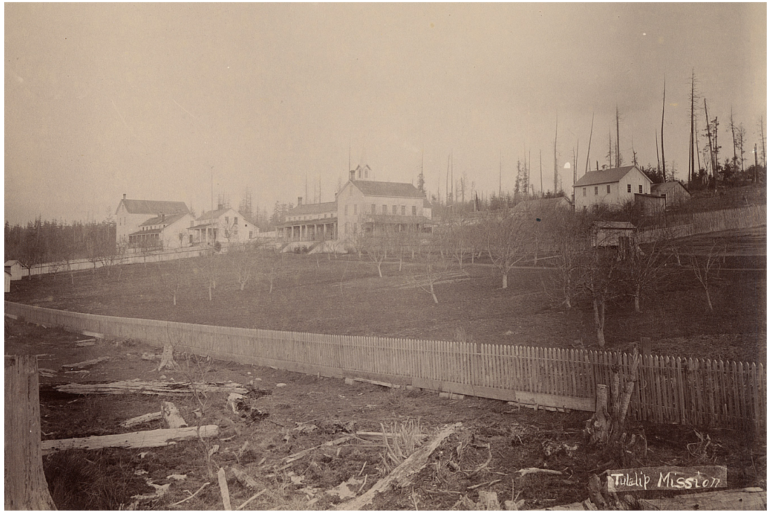
Our Lady of Seven Dolors School, Tulalip, Washington Territory, 1880s. Image #36.A1.1

When in 1878 the Missionary Oblates were called to work in western Canada, the sisters began teaching the boys as well. The school flourished until being taken over by the federal government in 1901. Though the sisters were asked to stay, they declined teaching in a secular institution. And so the short-lived mission, for the sisters, came to an end. The school continued to operate as a federal institution until 1921. 🌱