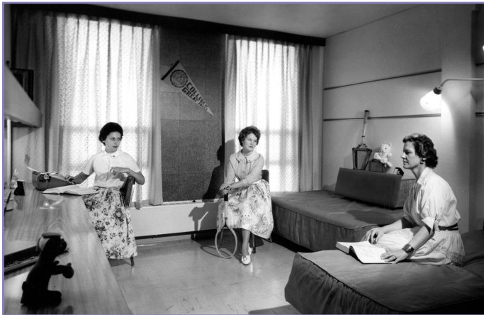
Dorm room, College of Great Falls, 1962 Image #190.2002-177