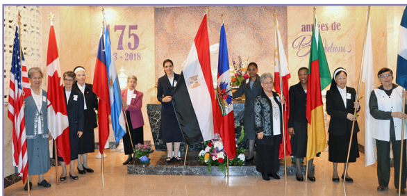
Sisters processed into the chapel with the flags of all the countries represented in the Providence community; here they pose at Blessed Emilie's tomb

https://tinyurl.com/Prov175th . We encourage our readers to take a look at these fascinating history capsules!