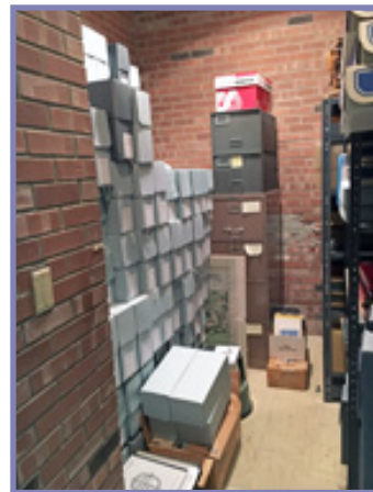
A peek inside the vault containing archival records in the University of Providence library

Sue Lee introduced me to the university's historical collection primarily stored in a walk-in brick vault adjacent to the library entrance. She explained that in the past it had been moved to different locations in the library and was in jeopardy of being moved again. No one wanted it to be potentially damaged or relegated to a less desirable location. Fortunately, the collection had previously been processed to a folder level